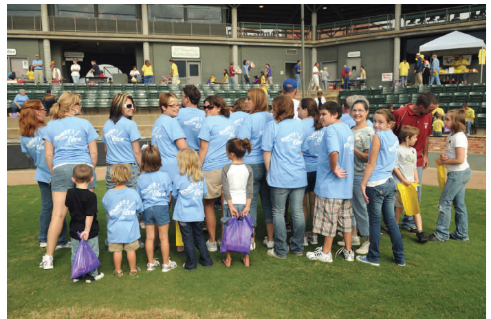
Konner's Krew 4RKids